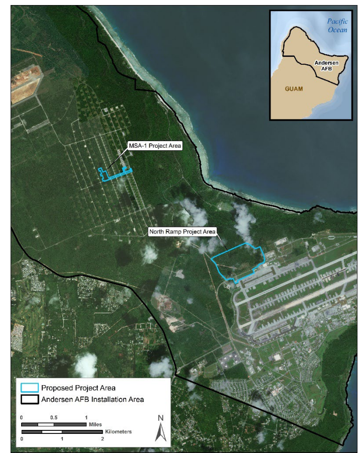
Figure 1: Overview of Locations on Andersen AFB Selected for Infrastructure Upgrades

Public scoping is an early and open process, conducted in compliance with NEPA, for identifying issues and alternatives to be addressed in an EIS and determining who (e.g., public and government agencies) is interested in the proposed action. Public outreach is conducted as a part of the public scoping process to provide information to interested parties and to receive comments on the proposed action, alternatives, and potential impacts. Comments received during the public scoping process are considered in the preparation of the Draft EIS. See the timeline on the back of this page for additional information regarding steps in the EIS process.