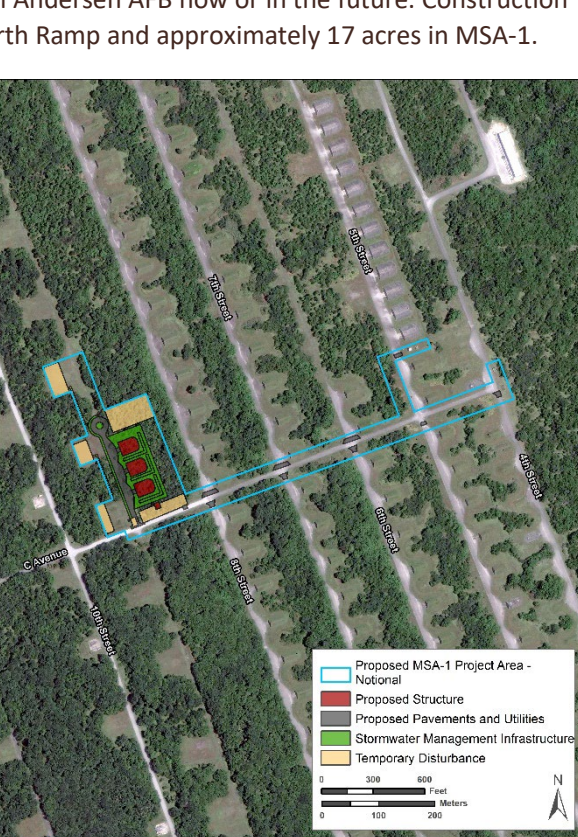
Figure 3: Proposed MSA-1 Infrastructure Upgrades