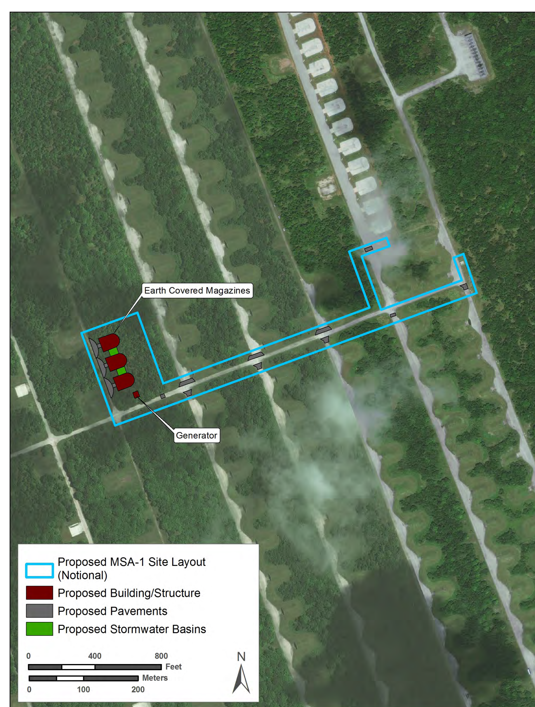
Figure: Proposed MSA-1 Infrastructure Upgrades